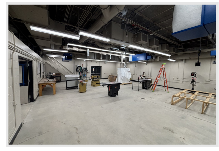
Equipment is being set and hooked up for use in the Wood Shop and neighboring shops. Almost ready to get school projects started!